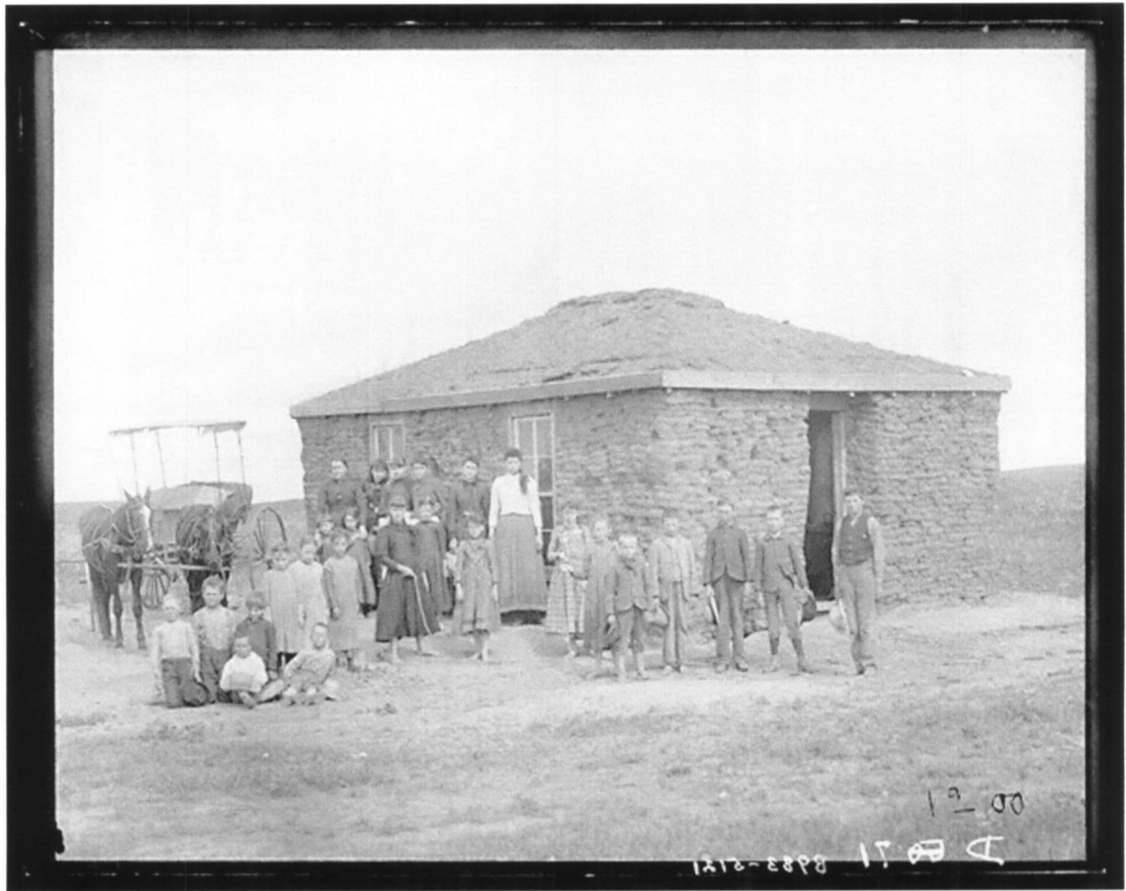
Students and teachers in front of sod schoolhouse, Custer County, Nebraska. 1891.